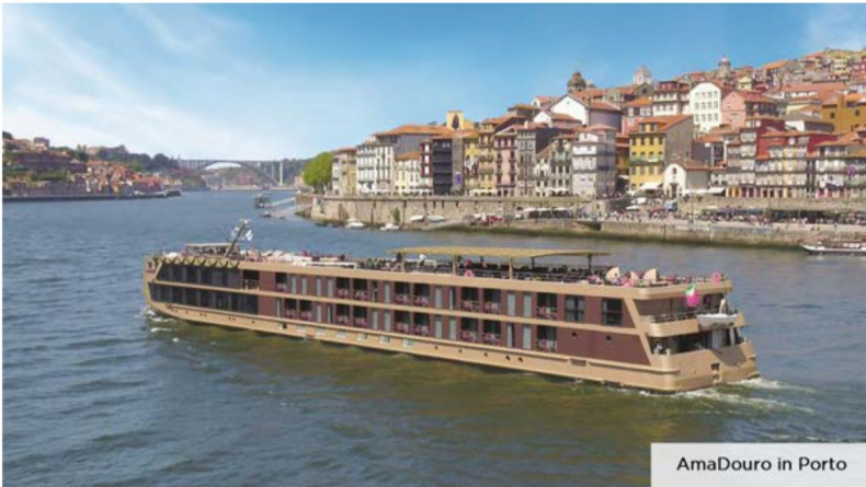
AmaDouro in Porto

7-night cruise | May 11-18, 2024 | Aboard AmaDouro