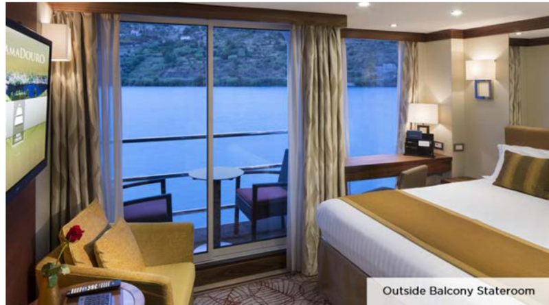
Outside Balcony Stateroom