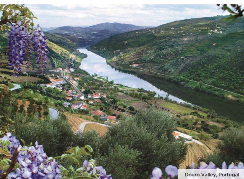
Douro Valley, Portugal